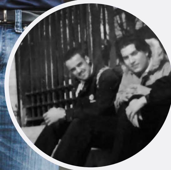
1993 COTTA CLASSICS HIGH SCHOOL Legnago, Verona, Italy